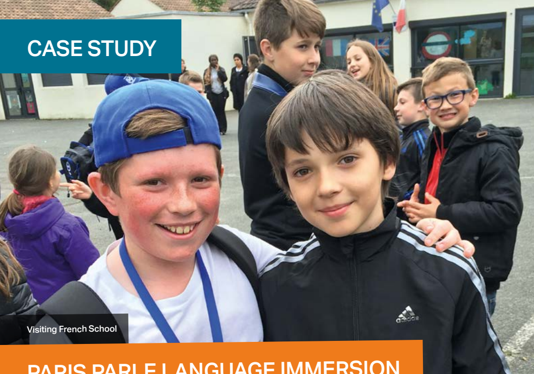
Visiting French School